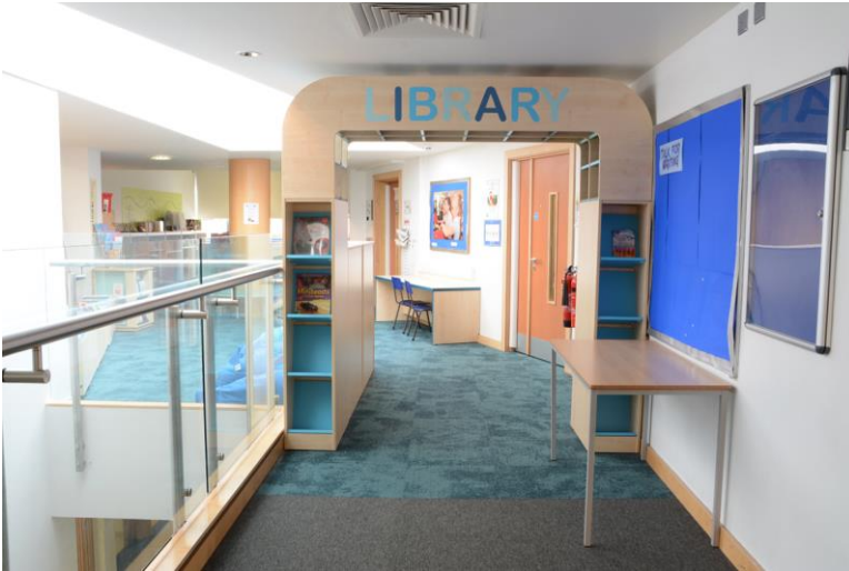
Our very well used library.