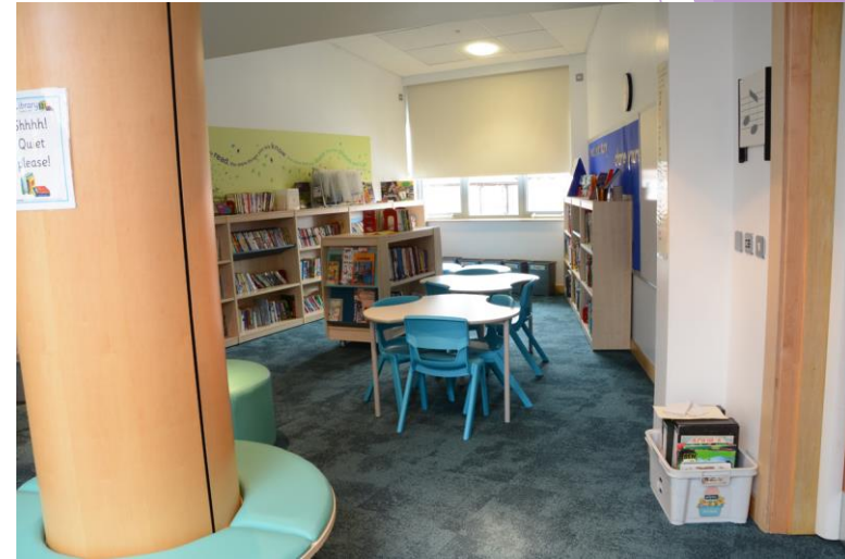
The library refurbishment was funded by our PTA.

The school hall - used for PE and assemblies and here being set up by Kids Collective who provide wrap around care at school.